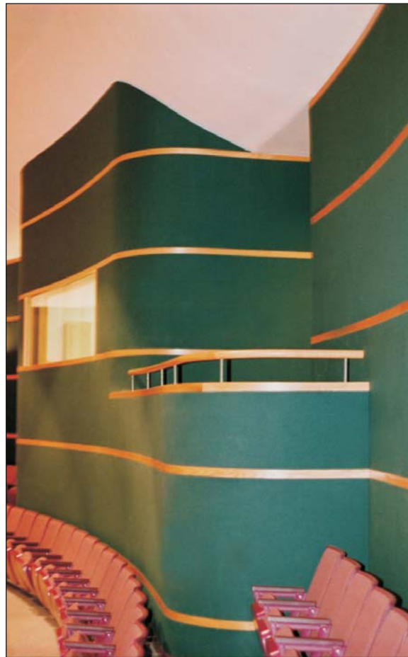
FABRITRAK®.FABRI-LOK® Tensioned Wall Systems