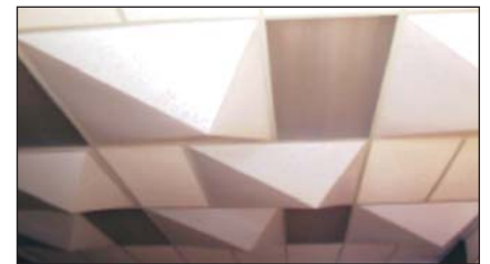
Pyramid and Barrel Diffusers