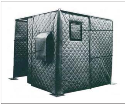
Industrial Noise Enclosure