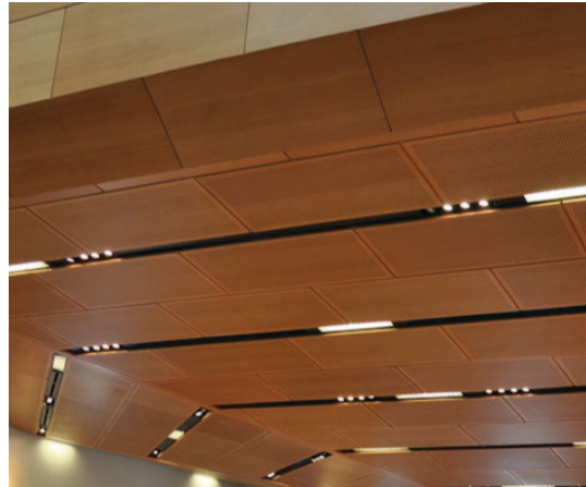
ELITE SEMI-CONCEALED GRID