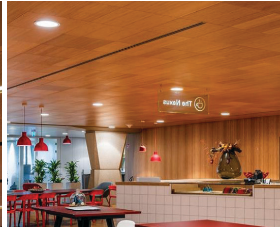
SELECT FULLY-CONCEALED GRID