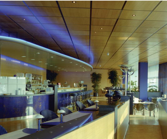
BASIC DROP IN TILE