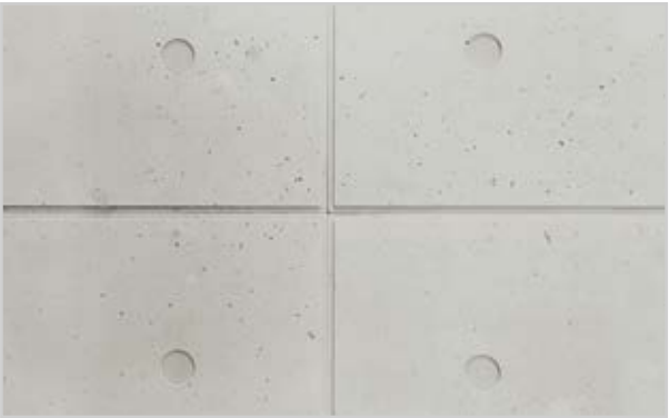
LightBeton® Formwork System transfers detailed impressions into the surface of the concrete