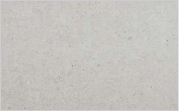
LightBeton® Classic grey

Concrete surfaces in 5 different versions with the typical pores.