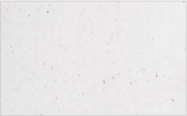
LightBeton® Classic white