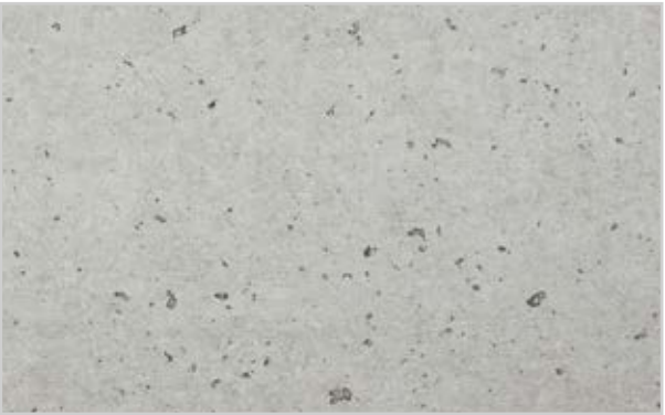
LightBeton® Urban grey