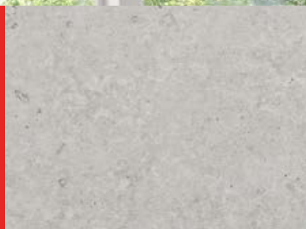
Studio Wall claddings